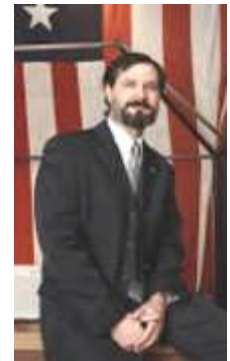
From the History Center